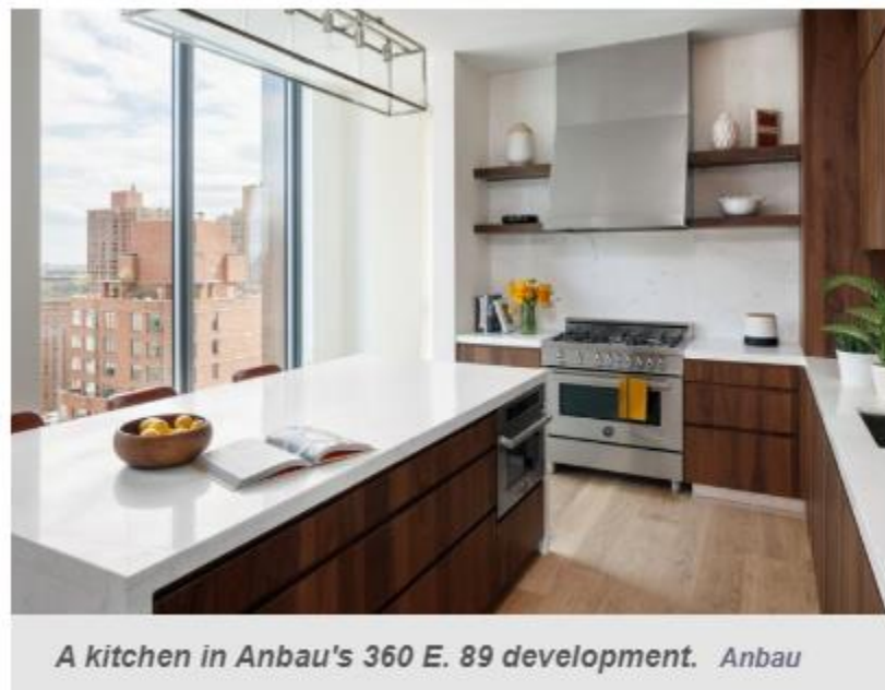
A kitchen in Anbau's 360 E. 89 development. Anbau

Finally, there are some design elements that seem like they might offer some sound protection, but really don't unless they're done well, at significant cost. Rice points to pocket doors, particularly in rentals, where it's doubtful a developer took on the expense of doing them right.